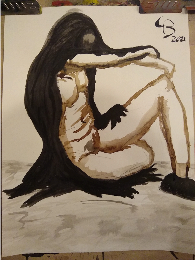
Sunbraving by Ciaran Byrne